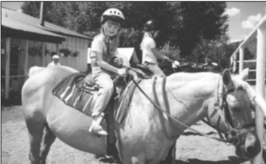
Horseback riding during Children's Week

going down and down. I could not see the bottom. The dream illustrates my appreciation of the fire as a central and deep dimension of spiritual practice for our time. We live such disembodied lives. The fire is a place to sit with something alive and rekindle our inner spiritual fire. We cannot do this without community. I hope to see you in Crestone in August.