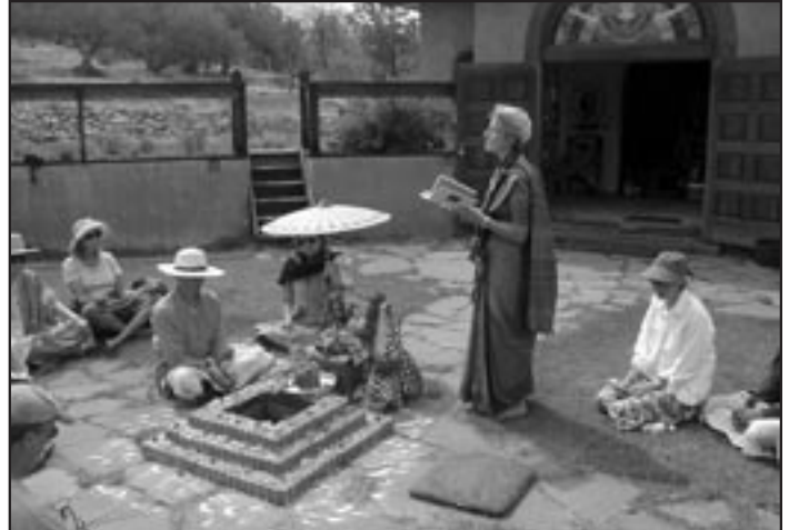
New, small havan kund

However, due to a shortage of snow this winter, we are in a severe drought. Even during Spring Navratri, we opted to perform all but the first two and last fire ceremonies in a smaller havan kund constructed in the courtyard of the temple to minimize the danger of a fire. We continued that until a statewide ban on all open fires was declared by the governor. We now hold our ceremonies without a fire. This is actually a very inner experience and very deep. We decorate the havan kund, do the lingam puja, and recite the mantras. At the word swaha, we make the offerings in our hearts asking that the fire of our devotion burn the offering and bring it to the Divine Energy that is being invoked with each mantra. We then offer the halvah and perform aarati, followed with chanting around the havan kund.