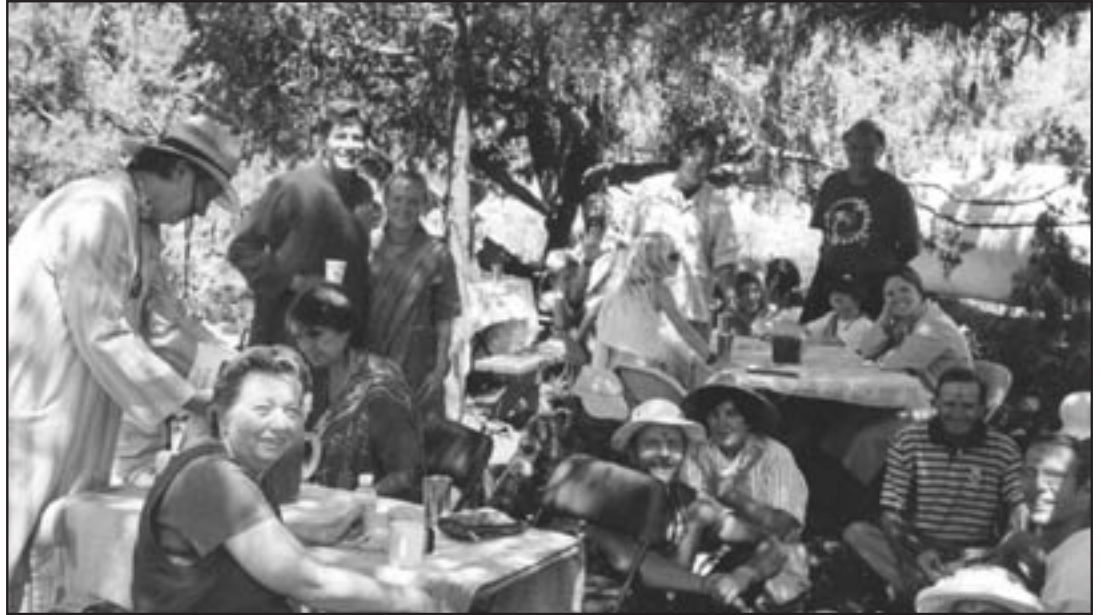
Bhandara after Samaj Meeting 2001

Summer already! Are you making summer plans? I hope the Children's week, Sacred Fire Ceremony training, and annual Samaj gathering at HUA in August are high on your list. The Babaji community and practices have much to offer in reconnecting with community, personal and earth healing, and inner peace. There is no better way to nurture our children and ourselves than by bathing in an Ashram experience.